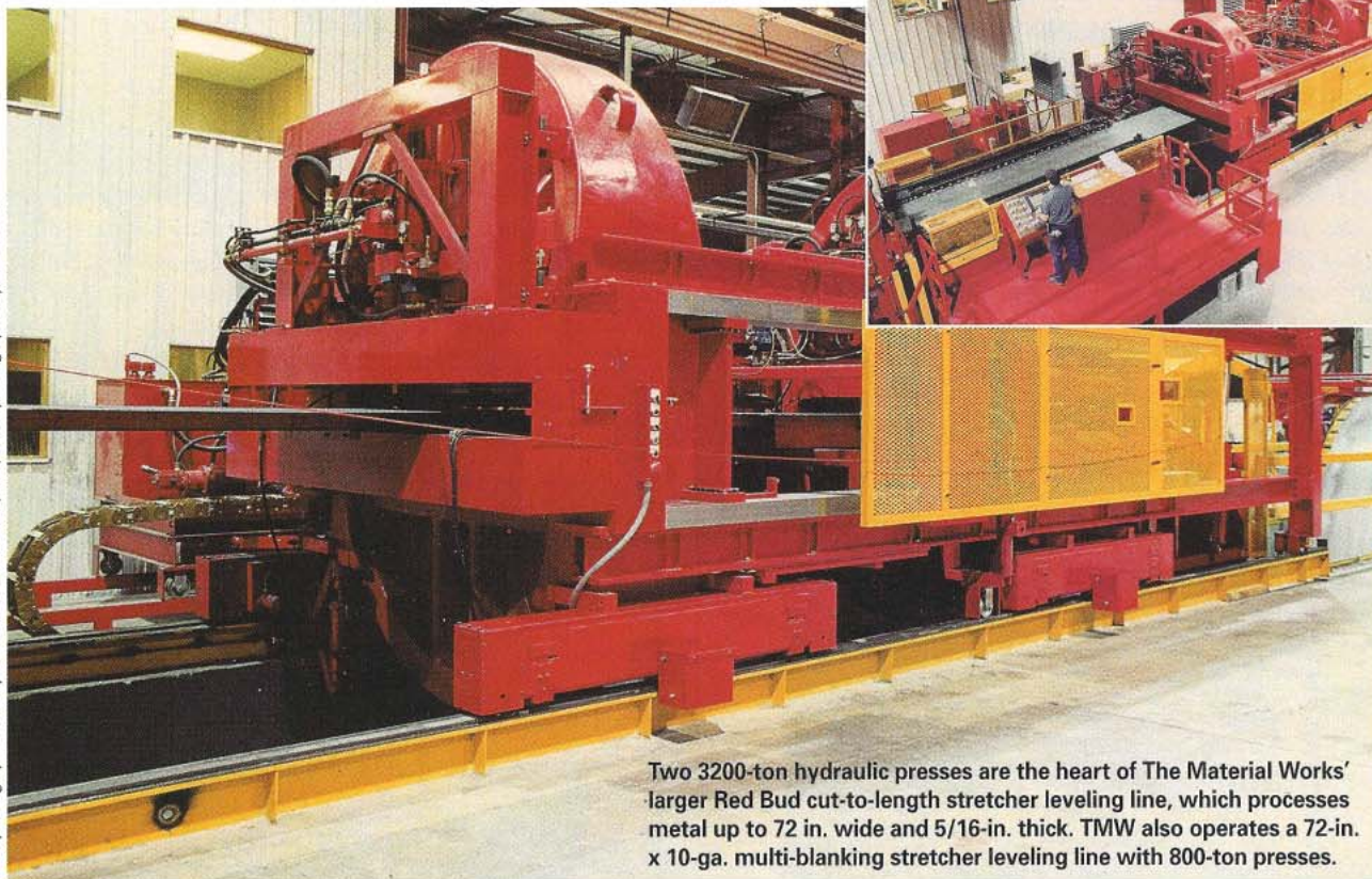
Two 3200-ton hydraulic presses are the heart of The Material Works' larger Red Bud cut-to-length stretcher leveling line, which processes metal up to 72 in. wide and 5/16-in. thick. TMW also operates a 72-in. x 10-ga. multi-blanking stretcher leveling line with 800-ton presses.

F or metals specifiers, it's the best of both worlds: hot rolled carbon steel with physical characteristics approaching cold rolled. This reduced-cost alternative to CRS is cut-to-size hot band processed through a patented combination of stretcher leveling and brush cleaning by The Material Works, Ltd. (TMW).