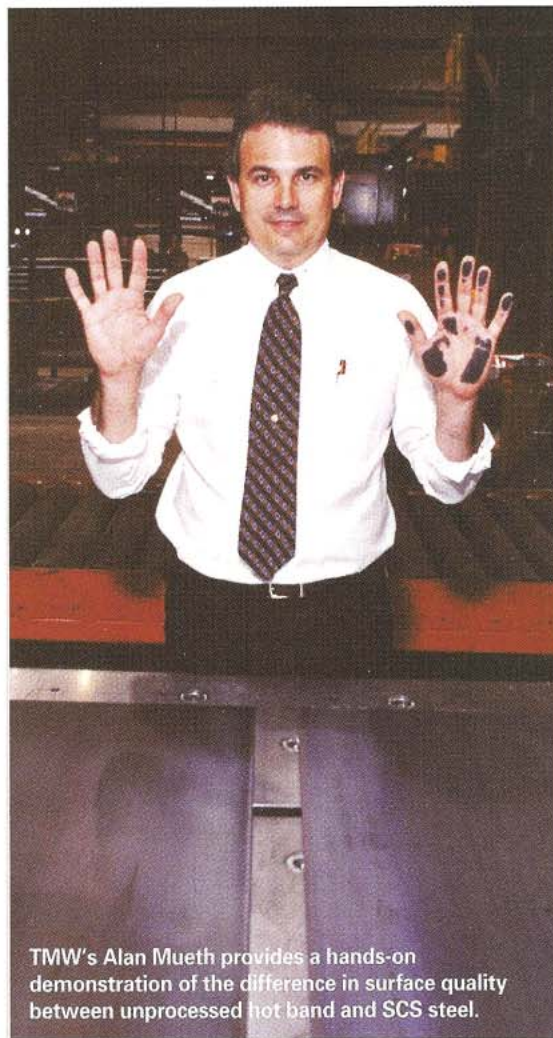
TMW's Alan Mueth provides a hands-on demonstration of the difference in surface quality between unprocessed hot band and SCS steel.

A unique two-sided brushing machine designed and built by Red Bud Industries contains three pairs of progressively finer